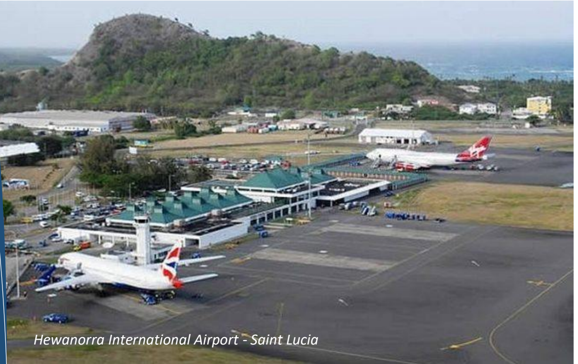
Hewanorra International Airport - Saint Lucia

Ideal Business Services Ltd. announces a new Airport Statistical Management Information System (ASMIS) to help small to medium sized airports monitor all aircraft, passenger and cargo activity more effectively.